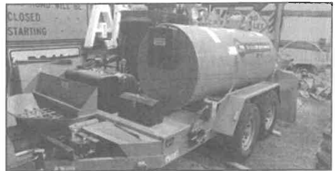
Durapatcher Emulsion Machine