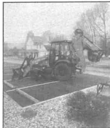
2020 Case Backhoe 580N

Tate Township Trustees also allowed the Maintenance/Cemetery Department to erect a retaining wall behind the maintenance barn. Heavy rains were washing away the trees and the slope soon to be threatening graves just close to the barn. The concrete retaining wall has been completed by the maintenance department eliminating any further issues with soil erosion.