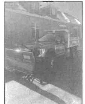
2020 Ford F-550 Maintenance Department Truck

often. Supervisor Stanley also acquired the old Fire Chief's vehicle which is a 2006 Ford Explorer that he uses to investigate various types of road and drainage ditch issues, checks road conditions when inclement weather arrives, and shows cemetery plot locations to family members in the Tate Township Cemetery.